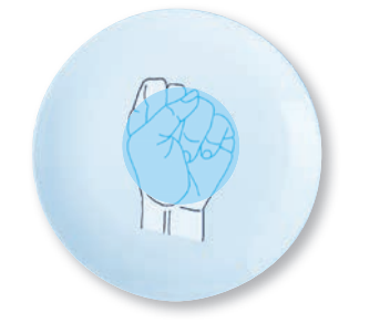
Grains and starches/Fruits Choose an amount the size of your fist for grains or starches, or fruit.

Your hands can be very useful in estimating appropriate portions. When planning a meal, use the following portion sizes as a guide: